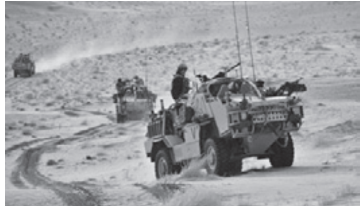
Out on patrol

At the moment I'm in MOB Price, which is located in the area of GERESH in Helmand, this is where A1 Echelon is based and all the CQMS's are back in this location for a couple of