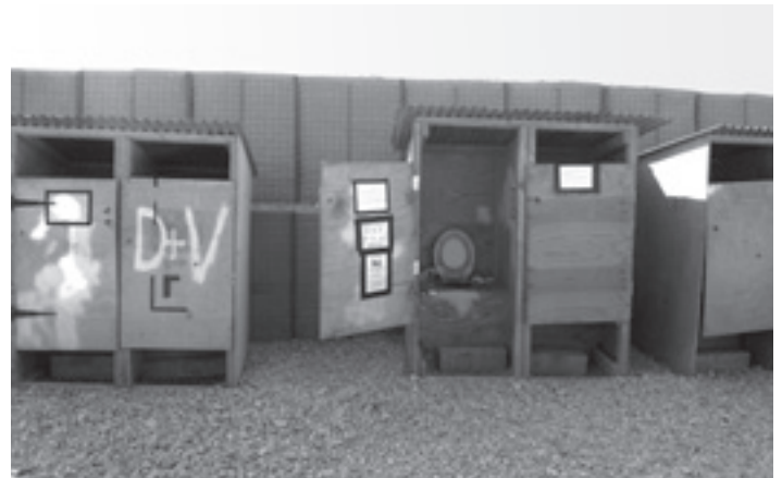
As I said....'great facilities!'

days to plan for future Ops and the resupply of the forward PB's. The facilities here are great, hot showers, good food, a coffee shop, heated tents all good. Whilst I've been here I've been for a few runs out with the Immediate Re-supply Group (IRG) and touched base with a few lads I haven't seen since we left Colchester, which seems like a long time ago now – but only 9 weeks.