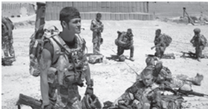
A patrol prepares to move out