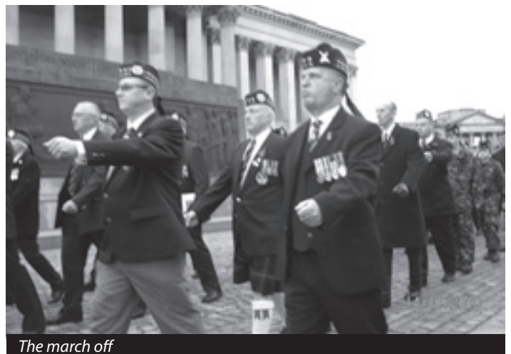
The march off