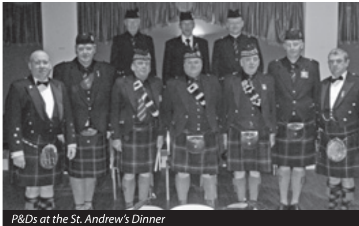
P&Ds at the St. Andrew's Dinner