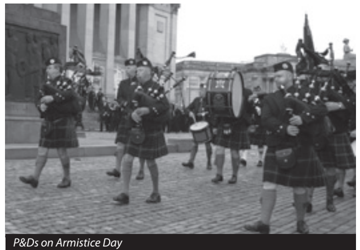
P&Ds on Armistice Day