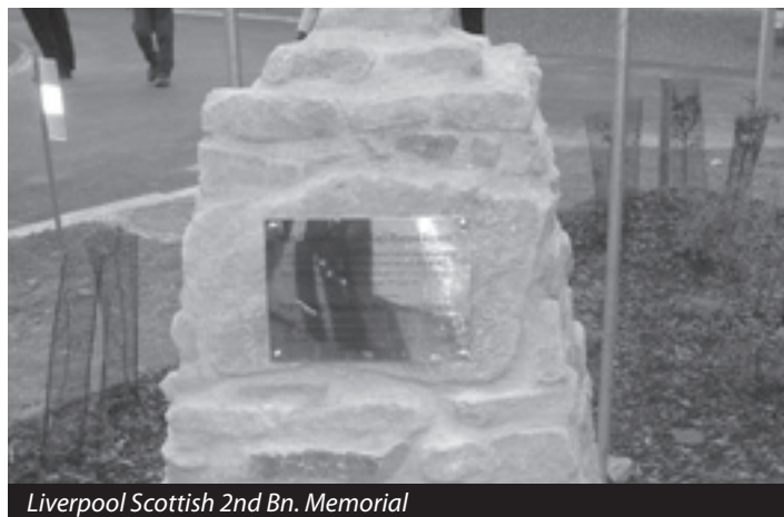
Liverpool Scottish 2nd Bn. Memorial