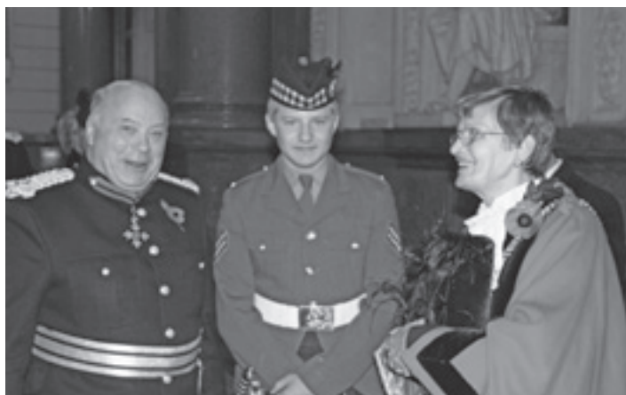
Liverpool Scottish Cadets were on duty on Remembrance Sunday

Our final parade of the year was of course Remembrance Day. This year we were given the privilege of being escort to several of the dignitaries; those that weren't involved in escort duties joined the Regimental Association, as part of their marching contingent. We of course placed our wreath at the Regimental stone, along with the Association's wreath and that of the serving soldiers.